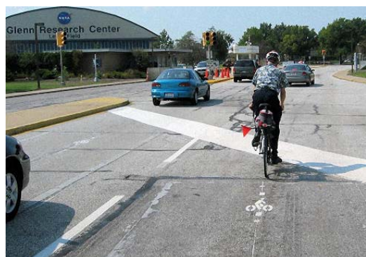
Fig 3 – Marked detectors at NASA