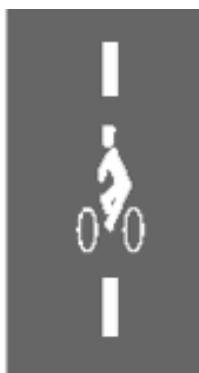
Fig 2 – Vehicle detector stencil